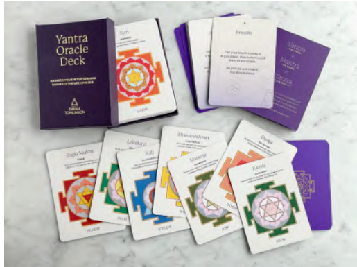
Yantra Oracle Deck

than me 'explaining' to them everything about what the Yantra 'should' be doing. They speak for themselves and reveal the messages needed in the moment.